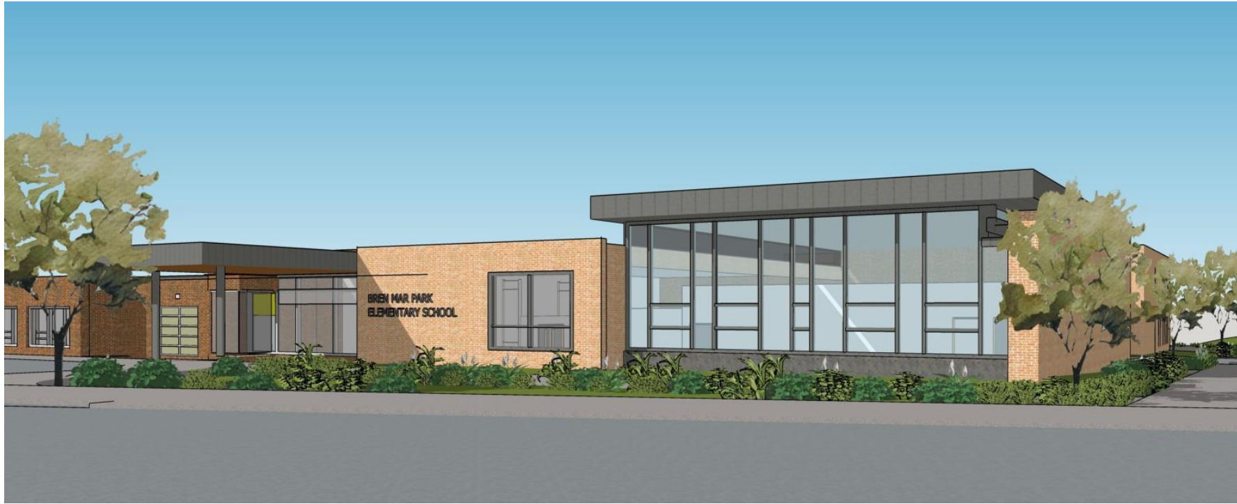
Proposed New Entry & Library