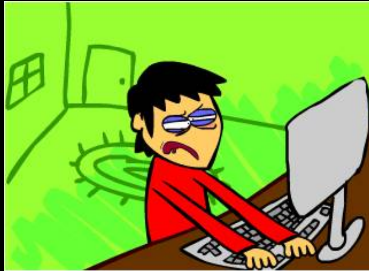
Still of an animation