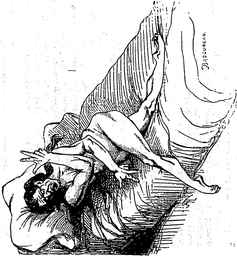
A hysterical convulsive attack of one of the patients in Salpêtrière Hospital during the nineteenth century. J. M. Charcot, the physician in charge of the clinic, spent much of his time studying the disorder. Note the crossed legs, similar to some of the Salem girls' fits.

So far, our reconstruction has dealt with only one aspect of the microcosm that was Salem in 1692—its invisible world. The area is a natural one to examine because it helps answer the central question of why the actors in the drama behaved the way they did. It would be tempting, having made the diagnosis of conversion hysteria, to suppose