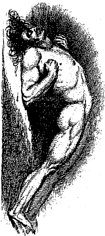
A classical hysterial convulsion, the arc de cercle , took the form shown in this nineteenth-century drawing.