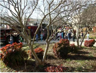
Kindergarten Fire Safety