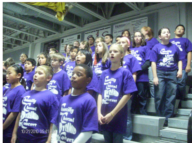
Pictures from the 5 th Annual Chantilly Choral Pyramid Concert – October 21, 2010