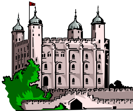
The Tower of London: More's prison.

When Parliament passed an act declaring the King's marriage to Anne Boleyn to be against God's law all loyal citizens took an oath supporting our King and Parliament; More refused to take this oath. He was taken to the Tower of London for questioning and given every opportunity to become a loyal subject. More has been found guilty of treason and will be beheaded on July 6 at the Tower of London.