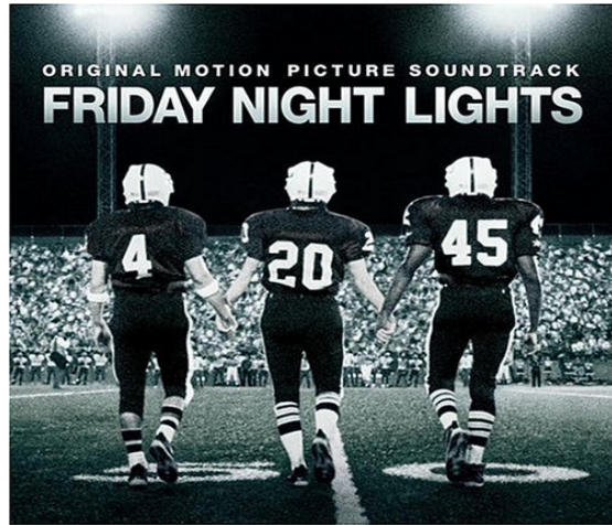
Friday Night Lights