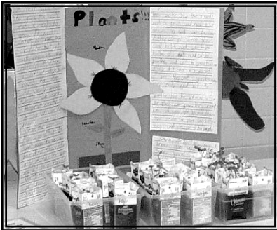
Reusing milk cartons for potting plants.

S pring is a great time to renew our community commitment to going green . Our students will be learning about the Three R's - Reduce, Recycle, Reuse , as we prepare for Earth Day Celebrations in April. At Kings Glen, students will enjoy readings of The Lorax , by Dr. Seuss and create posters with environmental themes. At Kings Park, we invite you to celebrate going green with us at our second annual Green Gala . The event will feature activities for the whole family, including an art walk of items created entirely of recycled materials. Please plan to join us April 23rd at 6:30 p.m.!