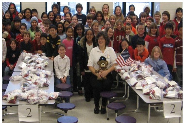
Students prepared care packages for our soldiers on November 7, 2007.

Troop Treats does accept donations, which are tax deductible. For more information please visit trooptreats.com .