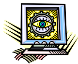
Image from a Website Example:

For images from the web drop the medium of original publication and include the complete publication information for the source in which the reproduction appears. (MLA5.6.2d)