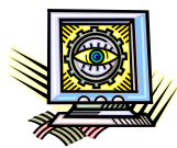
Image from a Website Example:

For images from the web drop the medium of original publication and include the complete publication information for the source in which the reproduction appears. (MLA5.6.2d)