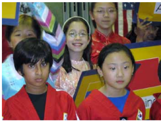
Both students and parents enjoyed wonderful performances at GBW’s International Night in May.

The GBW Reflections deadline for submissions will be in mid- to late-October 2009. Further information, including the entry form and specific guidelines for each category, is available on the Virginia PTA website at www.vapta.org .