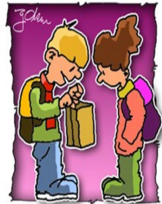
"Let's see... beef jerky, potato chips, gummy bears. That's all my major food groups."

1. Be prepared for your children (and for you) to experience a surfacing of emotions. The range of reactions will vary depending on your children's personal history and connection to attacks. Many children will exhibit little to no change in emotion or behavior. Older children may re-experience feelings of anxiety, fear, anger, or grief like those felt during the attack. Related symptoms may include disruptive behavior, reduced concentration, heightened irritability or sensitivity, and withdrawal. Usually, symptoms will subside with your reassurance and support. Keep in mind that children,