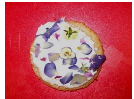
This cookie decorated with edible flowers by students looks good enough to eat.

Even though there was a chill in the air during the January intersession, students in Mother Nature's Bounty enjoyed the 'fruits' of warmer weather when they decorated their cookies with edible flowers. Students in Back in the Day created butter and horn books. Capital Currency students learned fiscal responsibility while they dreamed about what they would be able to do with their money someday. Count Your Pennies participants recognized whether they were being a producer or consumer while Franconia Fitness participants learned about the importance of nutrition, relaxation techniques, and how to read food labels. All this and more occurred during the one week intersession. Brochures for the spring intersession will be sent home on February 20. Registration will follow February 23-27, 2009.