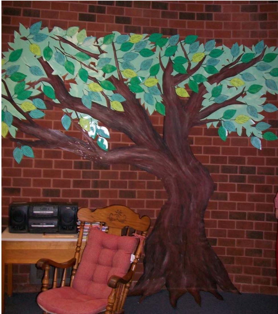
The BLOOM Tree