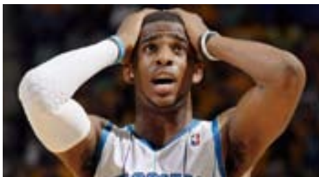
Chris Paul will be traded to the L.A. Clippers in time for the start of the 2011-2012 NBA season

Finally, on November 26, 2011, the National Basketball Players Association and NBA owners reached an agreement. The owners would pay 51.15 percent of basketball-related income to the players, which is much lower than what the owners had proposed at the 47-53 percent revenue split. The new 66-game season will start on Christmas day December 25, 2011. Pre-season workouts started on December 1st. All of our basketball fans at Falls Church High are more than excited to have the NBA returning for the 2011-2012 season.