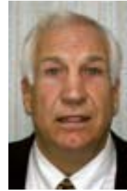
Jerry Sandusky in 2011